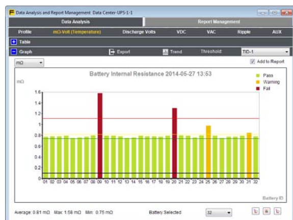
Histogram of a battery string with user defined threshold.