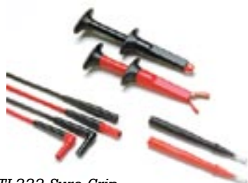
TL223 Sure Grip Electrical Test Lead Set