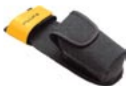
H3 Clamp Meter Holster