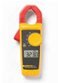
Fluke 323 True-RMS Clamp Meter