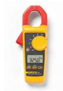
Fluke 325 True-RMS Clamp Meter