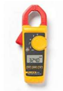
Fluke 324 True-RMS Clamp Meter