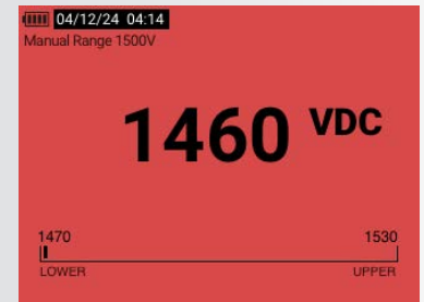
Limit gauge - outside of range