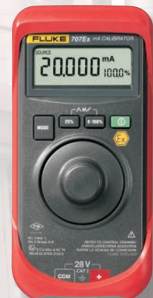
Fluke 707Ex Loop Calibrator