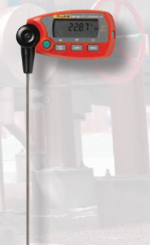
1551/1552 "Stik" Thermometers