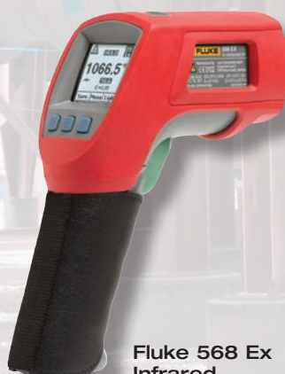
Fluke 568 Ex Infrared