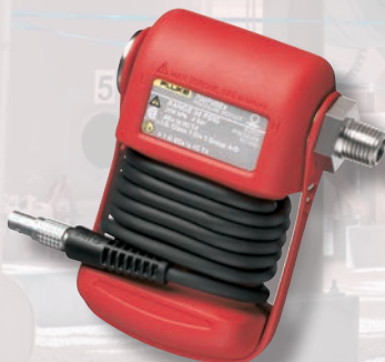
Fluke 700PEX Pressure Modules