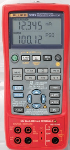
Fluke 725Ex Multifunction Process Calibrator

Fluke offers a wide range of reliable, accurate and intrinsically safe tools. Including the NEW 28II Ex True-rms Multimeter and the NEW Fluke 568 Ex Infrared Thermometer , which compliments the line of Fluke intrinsically safe field calibrators.