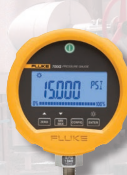
700G Series Precision Pressure