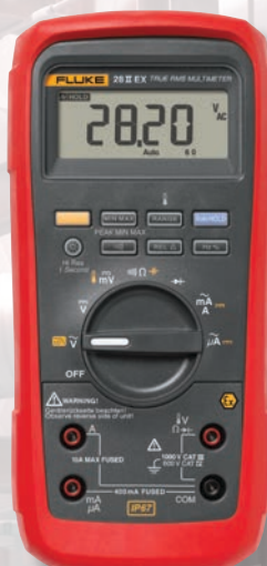
Fluke 28II Ex True-rms Industrial Multimeter