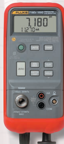
Fluke 718Ex Pressure Calibrator